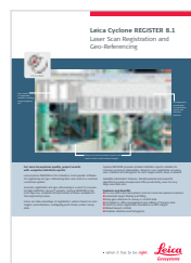
Leica Cyclone REGISTER Datasheet

Leica Geosystems AG Heerbrugg, Switzerland