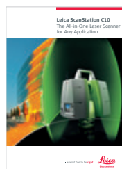
Leica ScanStation C10 Brochure