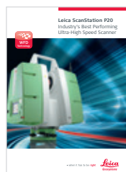
Leica ScanStation P20 Brochure

Illustrations, descriptions and technical data are not binding. All rights reserved. Printed in Switzerland – Copyright Leica Geosystems AG, Heerbrugg, Switzerland, 2014. 819927en-us - 04.14 - galledia