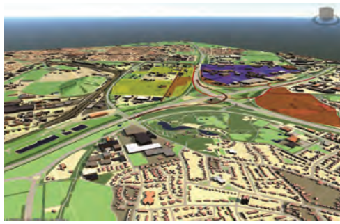
Help build stakeholder support with realistic project visuals.