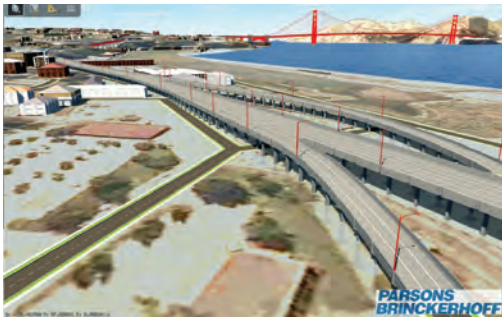
Clearly communicate design intent to assist with approvals.