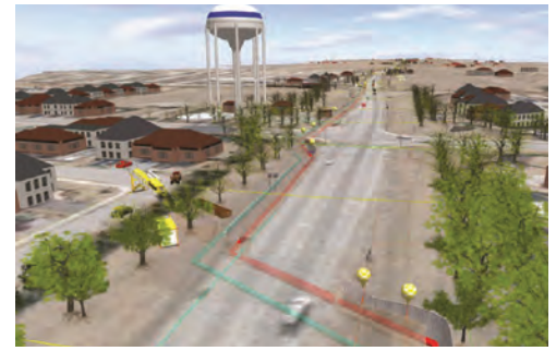
Autodesk InfraWorks.